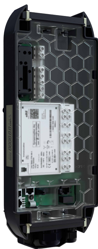
Wall installation with eCLICK

eCLICK is the docking station for attaching the eBOXes smart, professional and touch. The eCLICK can be used for wall installation or in ePOLE duo. The installation of the eCLICK must be carried out by a qualified electrician. Subsequent attachment or replacement of an eBOX can be carried out by the user if required.