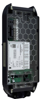
Wall mounting with eCLICK

eCLICK can also be used as an installation basis for subsequent eBOX attachment without an electrician.